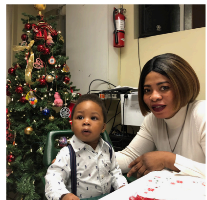
Mother and child at our Christmas dinner for Shelter Clients in December.