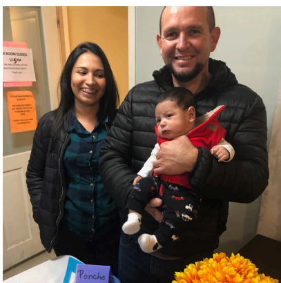
Family with their infant son who was one of the children born while living at the shelter in 2019.

P.S. We write this report in April 2020, in the midst of the COVID-19 pandemic. Our vision and mission remains the same as we shelter and provide a safe space for refugee claimant families. We are home to families so we haven’t shut down or gone completely online. We have made significant changes in how we do the work, but the work continues.