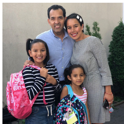
Family with new back packs at our Back to School barbeque in September.