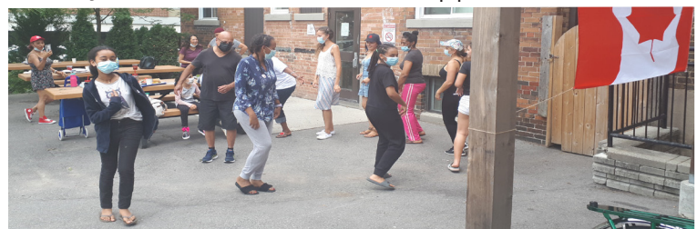
Above Image: Canada Day Celebration Cover Image: Back to School BBQ