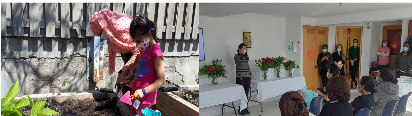
Community garden (left) and International Women's Day event (right)