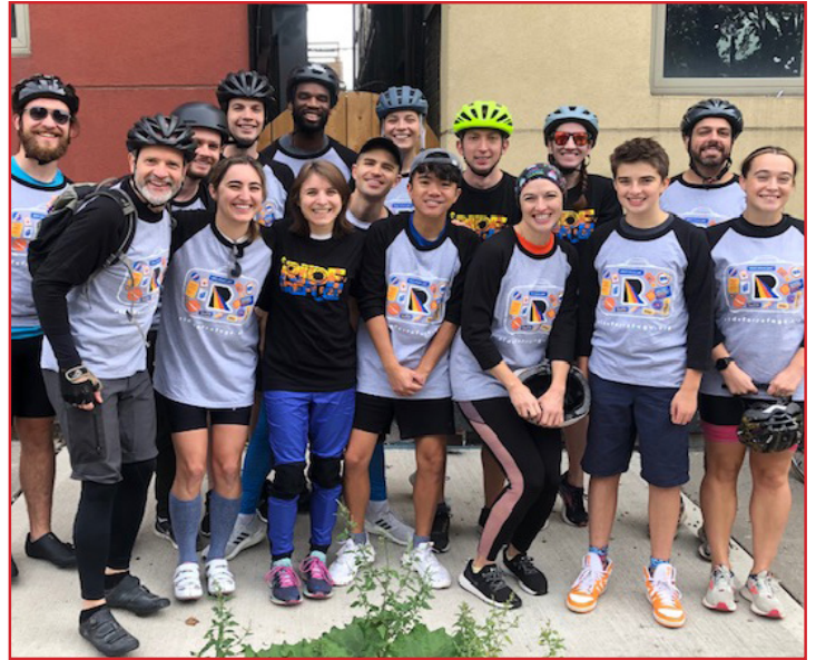
The FreeChurch Toronto Ride for Refuge Team

The next Ride for Refuge event will be on September 23, 2023. Check rideforrefuge.org for up-to-date information on how to take part. There are both walking and bike riding options to participate. We hope you'll be able to join us then and continue to help us provide the support refugees need!