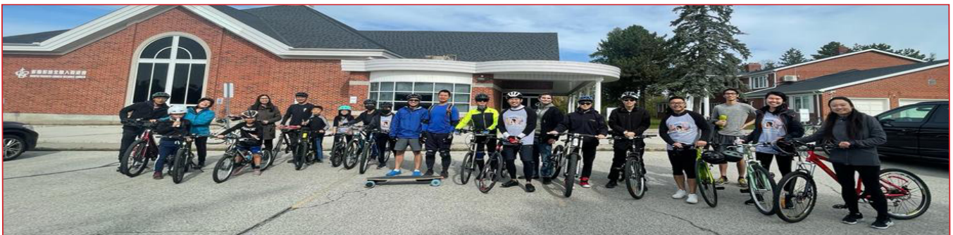
The Flynn Group of Companies (Top) and North Toronto Chinese Alliance Church (Bottom) Ride for Refuge Teams