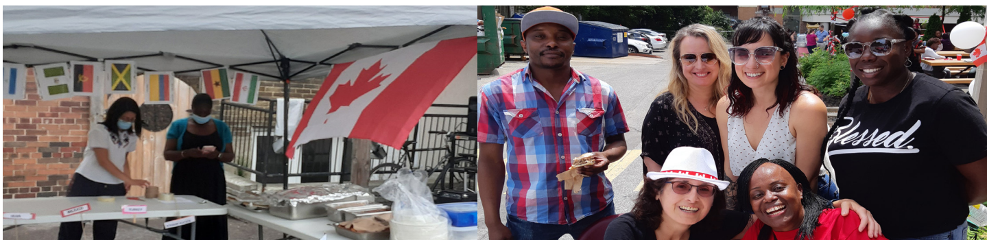
Multicultural Day (left) and Canada Day BBQ (right)