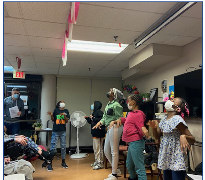
The children's performance at the O'Neill Centre

The goal is to start making these events a regular occurrence every couple of months.