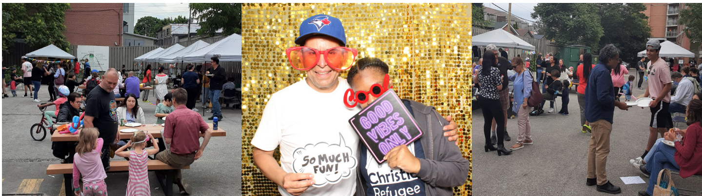
Photos from our World Refugee Day celebration