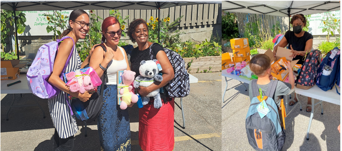
Above Images: Christie's Back-to-School BBQ was held in September. Children from the shelter, as well as Outreach clients, received backpacks full of school supplies